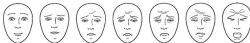
Figure (1): The Faces Pain Scale for Assessment of the Severity of Pain (Wong et al., 2001)